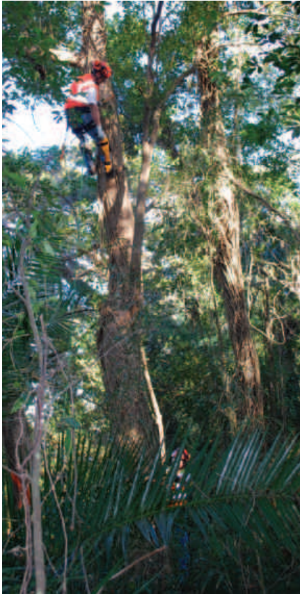
Volunteers trim invasive camphor's to allow more light to reach the historic palms.