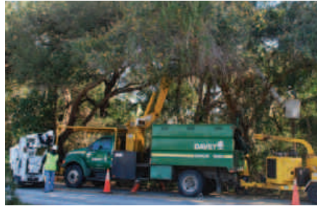
Davey's crew dedicated a full Saturday to help Nehrling Gardens volunteers.